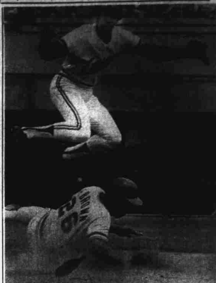
TWINS-TIGERS - BLOOMINGTON, MINN. - Twins' 2nd baseman Rod Carew leaps over the sliding Tigers' Gates Brown (26) as he relays the ball to 1st base to get Tigers' Willie Horton (not shown) for a double play during the 1st inning of the Minnesota-Detroit game 6/3.

The "Old Timers" are composed primarily of a bevy of local baseballers, some formerly in the minor leagues, who love the sport. Such