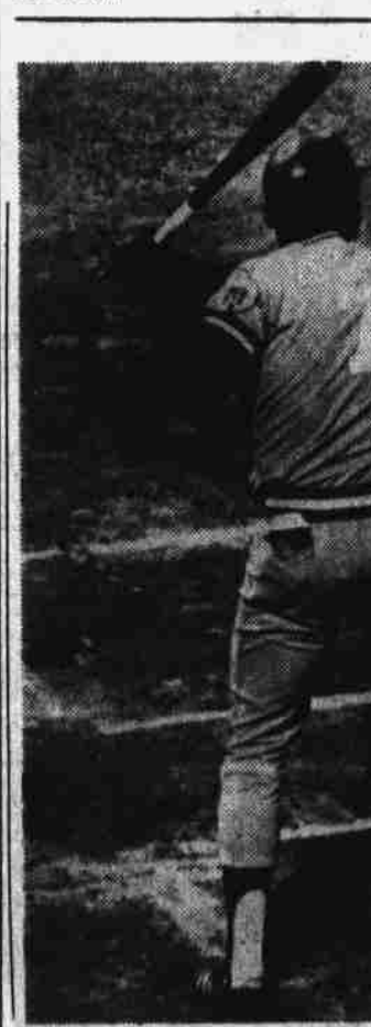
KANSAS CITY ROYALS-RED SOX-BOSTON Royals' slugger John Mayberry stands a little too deep in the batters box for