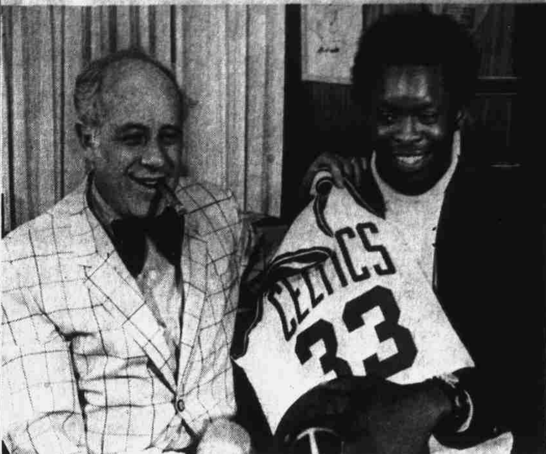
BOSTON CELTICS General Manager, Red Auerbach (L) shows off Celtics' top draft

BILLY ECKSTINE tendered special tribute to ASCAP for his 35th year in showbiz and his "outstanding contribution to the music world as a pivotal figure in jazz music history". And talk of jazz history, Leonard Feather is working with MCA to revive some old Decca masters featuring The King Cole Trio