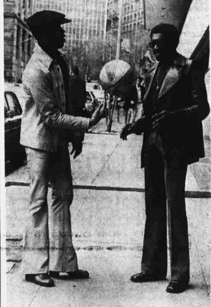
Walt Frazier (L) and Earl Monroe of the New York Knicks keeping physically fit for next basketball season.

Trail riding with a Kawasaki can add a new dimension to a hunter's and fisher's avocation. With the new Kawasaki G-4 100 Trail Bike, for instance, you can go exploring for a good 100 miles in back country, selecting many places to fish and hunt without ever worrying about refueling. It has a total of 10 possible gears, and in low range it can climb a 40 degree hill. The G-4 has just the perfect combination of balance and pulling power, plus knobby studded tires, to make it the king of the off-road. The rear shocks are so fine that the bike won't seaway at high speeds when you go crusading across rough and rocky terrain or whizzing along a sandy beach. The muffler is quieter and a spark arrestor has the approval and blessing of the Forestry Code. The G-4 has a rear luggage carrier... designed for the sportsman in mind... to give him more than a sporting chance to take whatever he needs with him. If you're a sportsman, or just an outdoors lover, give yourself a sporting chance. Chances are it'll enhance your avocation!