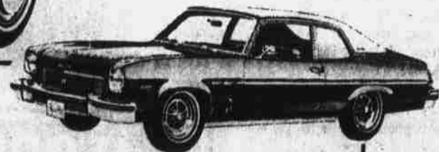
'73 OPEL WAGONS '73 BUICK APOLLOS