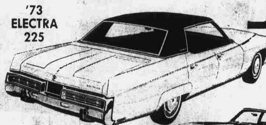
'73 ELECTRA 225