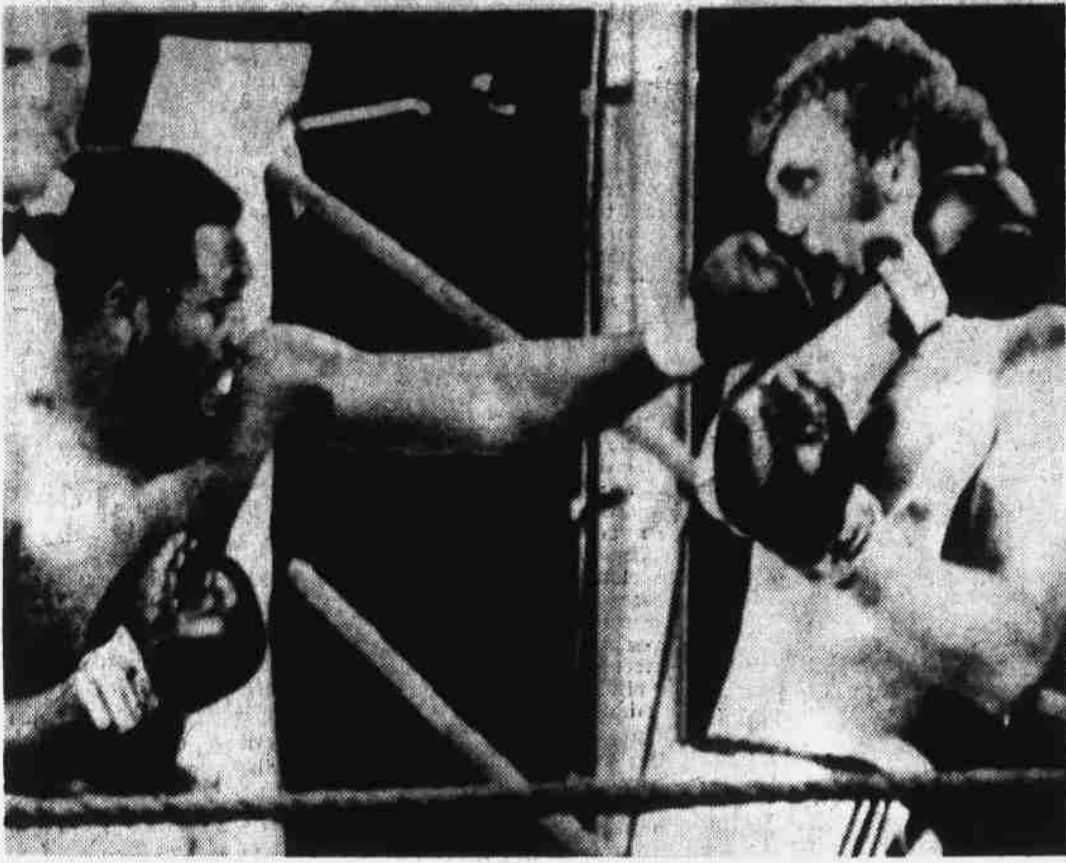
CONNECTION — EARLS COURT, LONDON Joe Frazier, of Philadelphia connects with his left as Joe

Bugner of Britain lays back on the ropes here July 2 during a 12-round bout. Frazier, former World Heavyweight Champion,