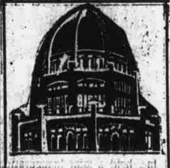
WORDS OF THE WORLD

How comforting it is to know that death is not an ending but just the beginning! Our beautiful and reverent memorial service reflects this joyous faith in the Resurrection at all times. SCARBOROUGH AND HARGETT, INC. Funeral Directors PHONES 682-1171 or 682-1172 919 Fayetteville St. Durham, N. C. 24-HOURS AMBULANCE SERVICE—24