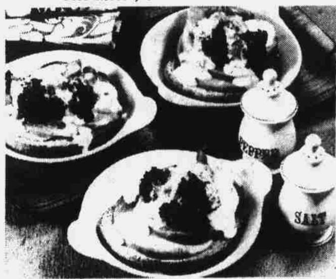
SAUCY SUPPER SANDWICHES (Makes 6 sandwiches)

Food Service Center Carnation Company Box 50 RS Pico Rivera, California 90660