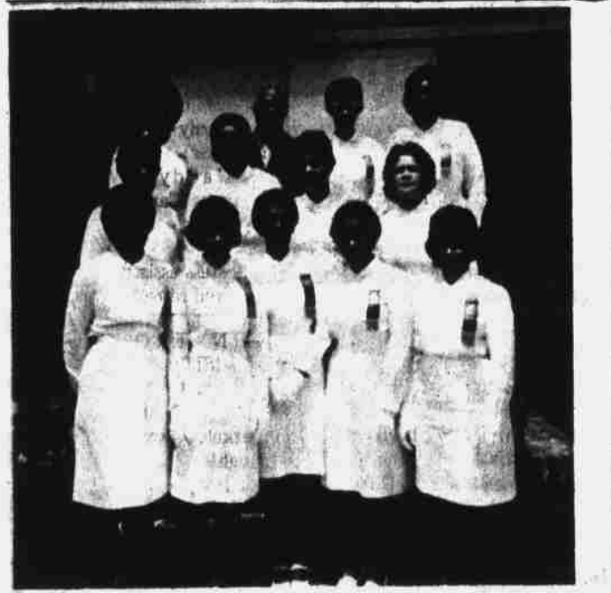
NEW LADY USHERS