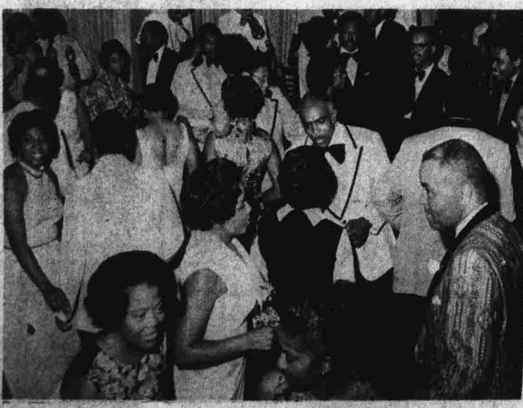
ADULT FORMAL "We are Together".