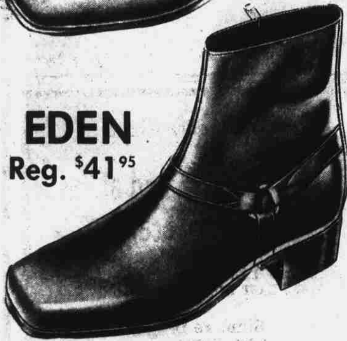
EDEN Reg. $41 95

THESE TWO BOOT STYLES ARE AVAILABLE IN BLACK, CHERRY, AND GOLD.