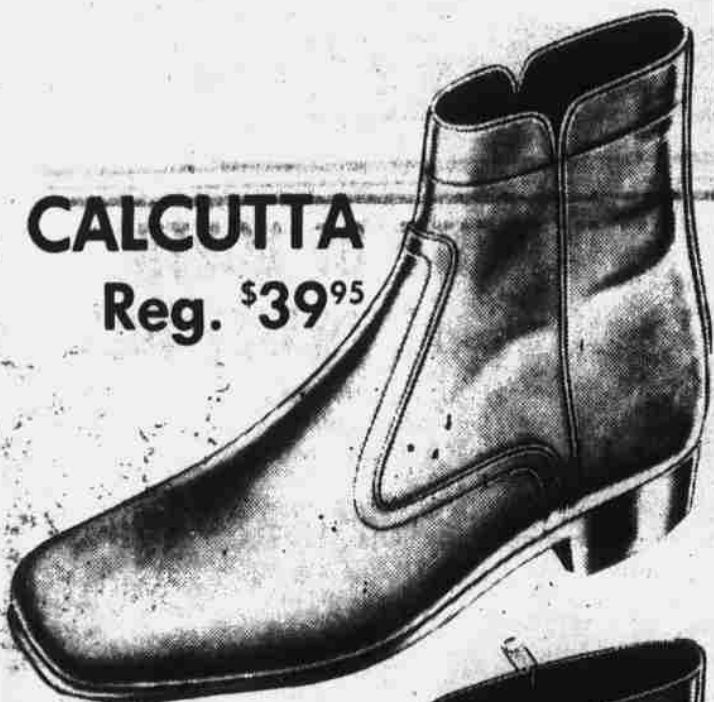
CALCUTTA Reg. $39 95