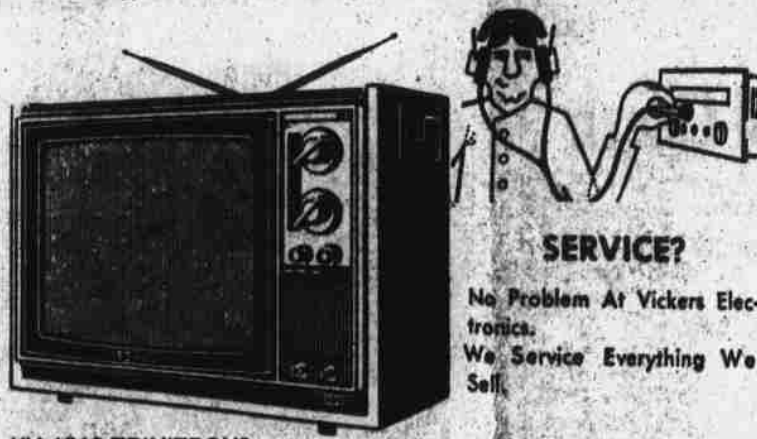
KV-1510 TRINITRON® COLOR TV