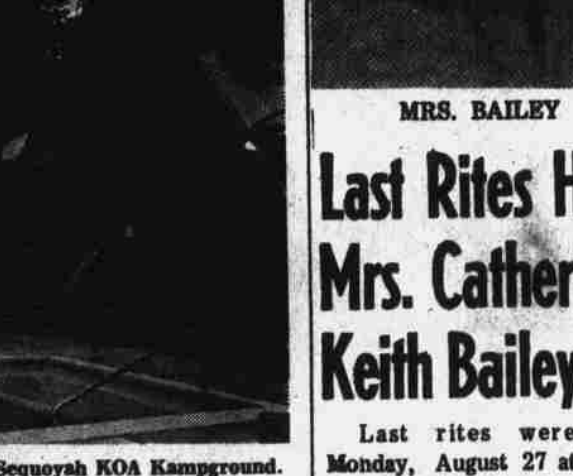
Pool and recreational building at Sequoyah KOA Kampground.

The beautifully designed swimming pool is located conveniently near the campground's recreational lounge. Showers, restrooms and laundry facilities are also available