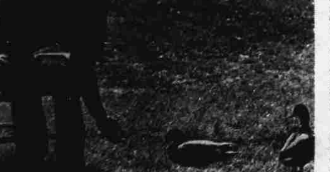
allard ducks est from visitor's hand.