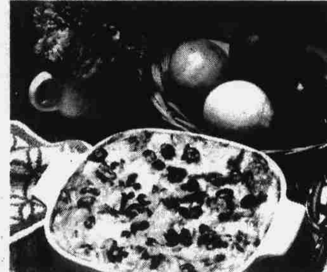
JIFFY BEAN BAKE (Makes 4 to 6 servings)

Jiffy Bean Bake is a change of pace vegetable dish with a full of flavor taste. It's full of extra nutrition, too, and stays moist and creamy because it's made with velvety evaporated milk. Just mix it together, then bake and serve.