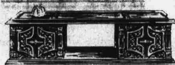
Cocktail Table 60" x 22"