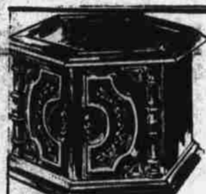
Hexagonal Commode 20" x 22"

Yes...many items will be sold at fabulous discounts Come and let the people at Riverview Furniture help you to big savings.