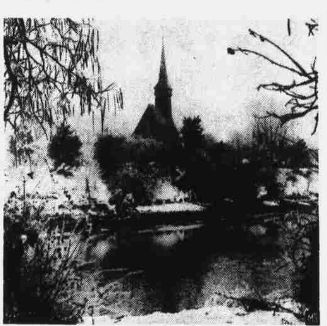
The Village Museum in the heart of Bucharest

There's a new star on the tourist-hoppers horizon these days. It's Romania—a land as old as Palaeolithic Age habitation and as new as the modern hotels designed for today's most sophisticated travelers.