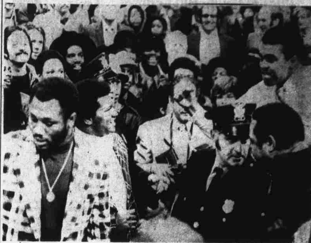
UPCOMING BOUT — Cleveland, O.: Muhammad Ali (in shirt sleeves at right) menaces Joe Frazier (at left) at heavyweight fight here 11/28. They will be meeting on the other side of ropes in upcoming bout.

Stuff each pitted prune with a whole roasted almond and 2 or 3 semi-sweet chocolate bits. Roll in instant cocoa.