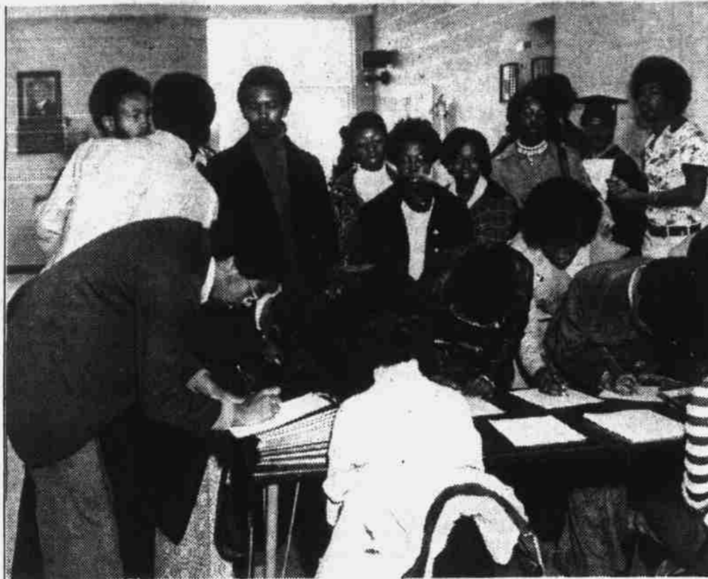
REGISTRATION AT ST. AUG. FOR SENIOR COLLEGE EMPHASIS DAY—These are students from the Durham Business College, who registered for the Senior College Emphasis Day, held at Saint Augustine College in the Boyer Building on December 11.

The oat crop North Carolina farmers harvested last summer was estimated at 3.6 million bushels. This is an increase over the previous crop of about 6 percent but sharply below the crop grown in 1971. Yield per acre is estimated at about 51 bushels, a state record. It compares with a national yield figure of 49 bushels per acre.