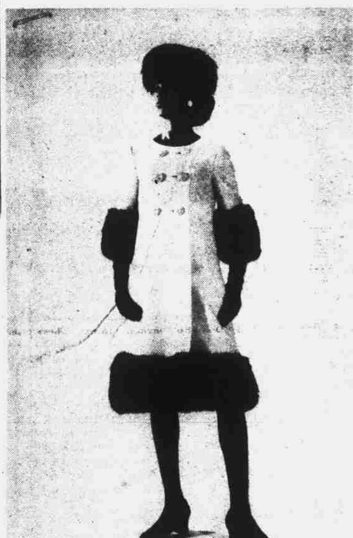
The Prophetic example of a great ensemble... white wool worsted after five coat and dress ensemble. The double breasted six jeweled bottom coat is lavishly bordered and cuffed in black norwegian fox. The dress features the daring low cut back interest...all from The Donald Brooks Collection.