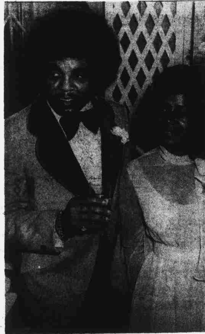
GROOM'S PARENTS —Mr. and Mrs. Joseph Jackson, parents of Jermaine Jackson, pose for photos following the marriage of their son to Hazel Joy Gordy.