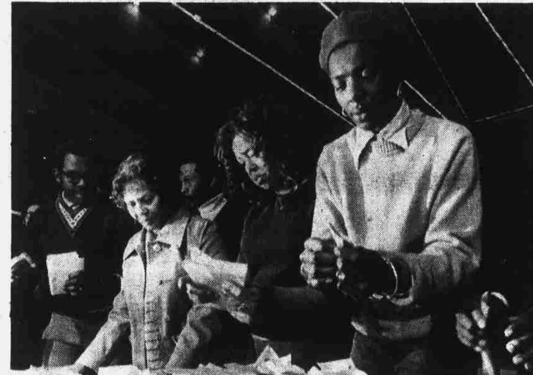
BALLOT TALLY-BALTIMORE , Volunteers tally up ballots of striking Baltimore City School teachers at a rally in Baltimore's civic center. The 3,000 teachers present voted overwhelmingly to reject the City's latest offer, and to continue their 16 day old walkout.