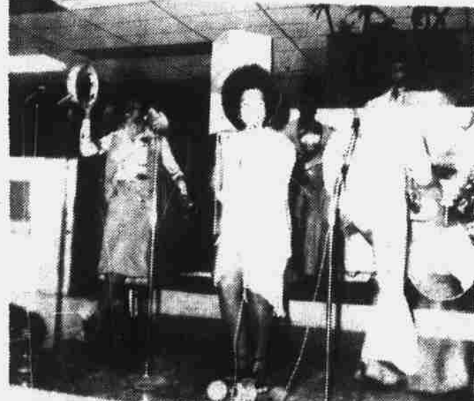
Black Experience has been together a long time and considered one of the best around. Toured with the Communicator Hater, backed up the Modulations - recently lost drummer and bass man.