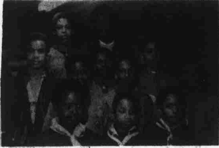
MEMBERS OF THE TROOP in attendance at the annual Blue and Gold Banquet held recently at the Kyles Temple A.M.E. Zion Church.