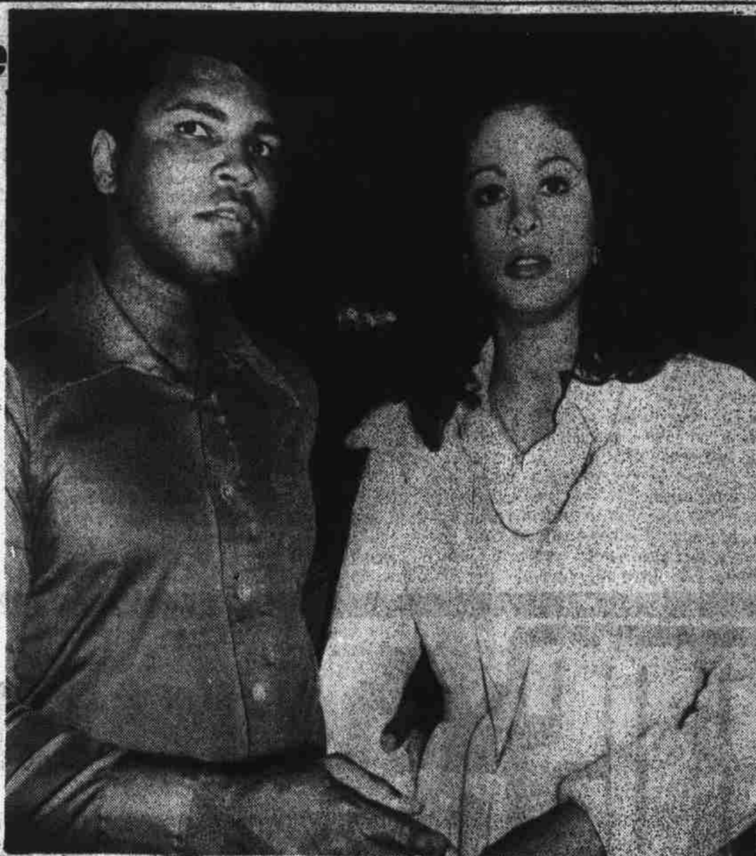
CHAMP AND BRIDE TO BE - Heavyweight champion Muhammad Ali chats with his bride to be Veronica Porsch. At press conference in New York to announce his upcoming title bout, Ali also announced his plans to marry Veronica in June.