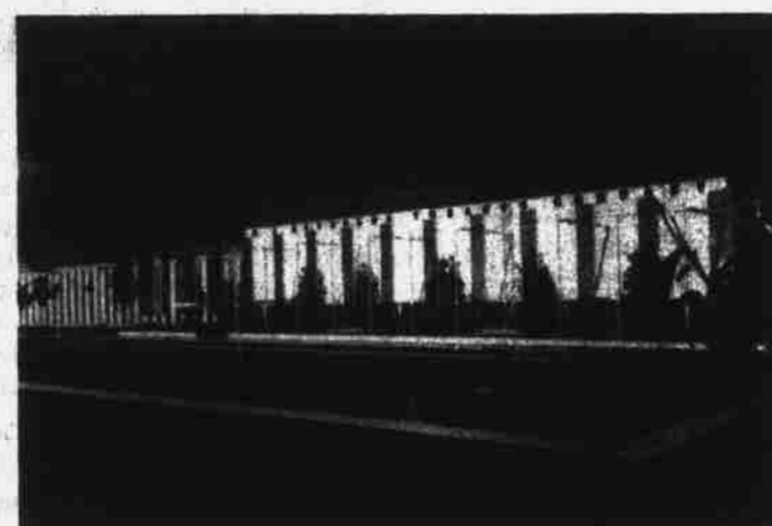
Whitaker Park cigarette manufacturing plant began operations on Oct. 16, 1961 and over 1.5 million have toured the facility since then. That number is expected to increase considerably with the dramatic new additions to the tour.

The pipe is in a splendid state of preservation and is made of Virginia maple wood. There is also a whistle cut in the pipe, by which, it is said, Sir Walter Raleigh summoned his servants.