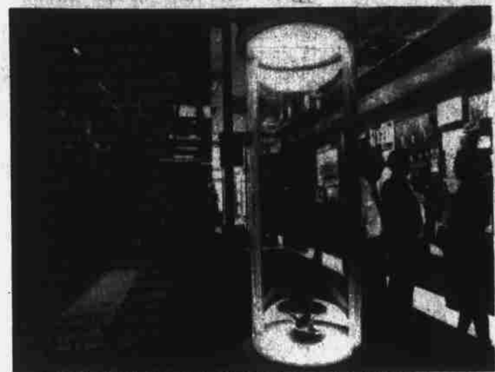
Sir Walter Raleigh's pipe (top one in enclosed cylinder) is one of the many artifacts that are now part of the revised R.J. Reynolds Tobacco Company tour at its Whitaker Park cigarette manufacturing plant in Winston-Salem, N.C.