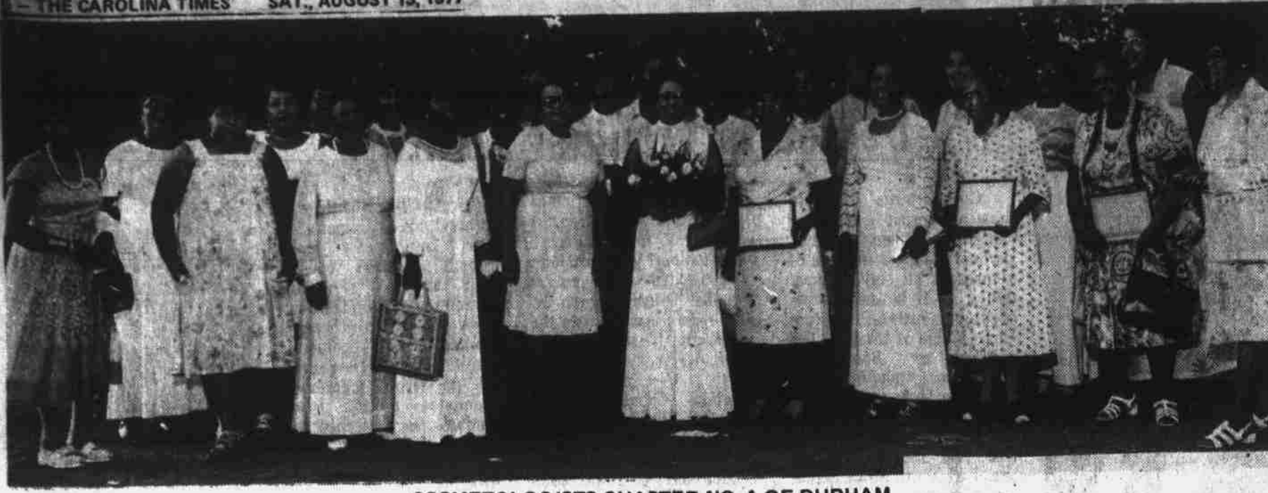
COSMETOLOGISTS CHAPTER NO. 1 OF DURHAM