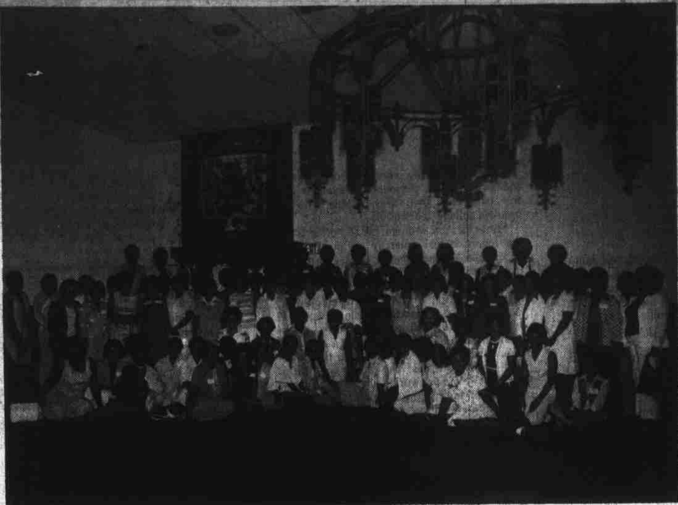
LINCOLN ALUMNI at the Royal Villa