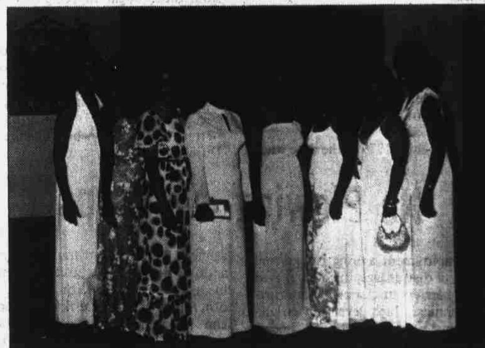
CLASS of '61 receives award for the largest number present from their class.