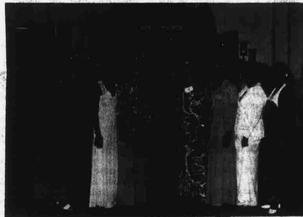
CLASS of '67 Celebrates 10th Anniv