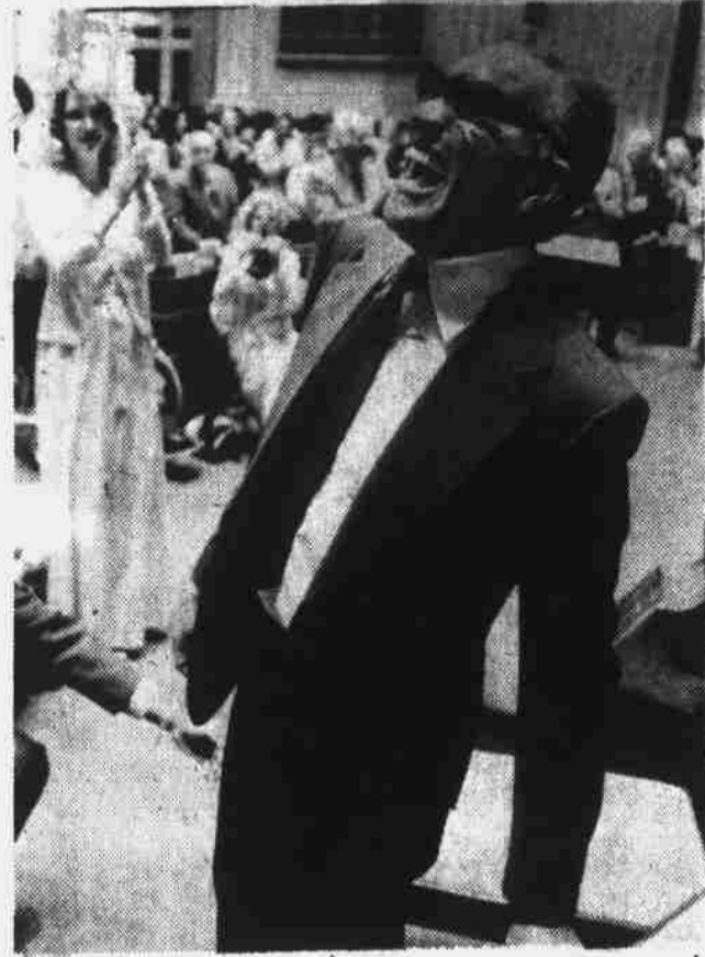
ATLANTA-Ray Charles thrilled by a standing ovation, accepts applause by state senators and representatives after he performed the new state song, "Georgia On My Mind". Charles a native of Albany, Ga., recorded the hit in 1958. The legislature adopted Charles' version as the state song last week and the blind singer will be given a braille copy of the proclamation by the governor.