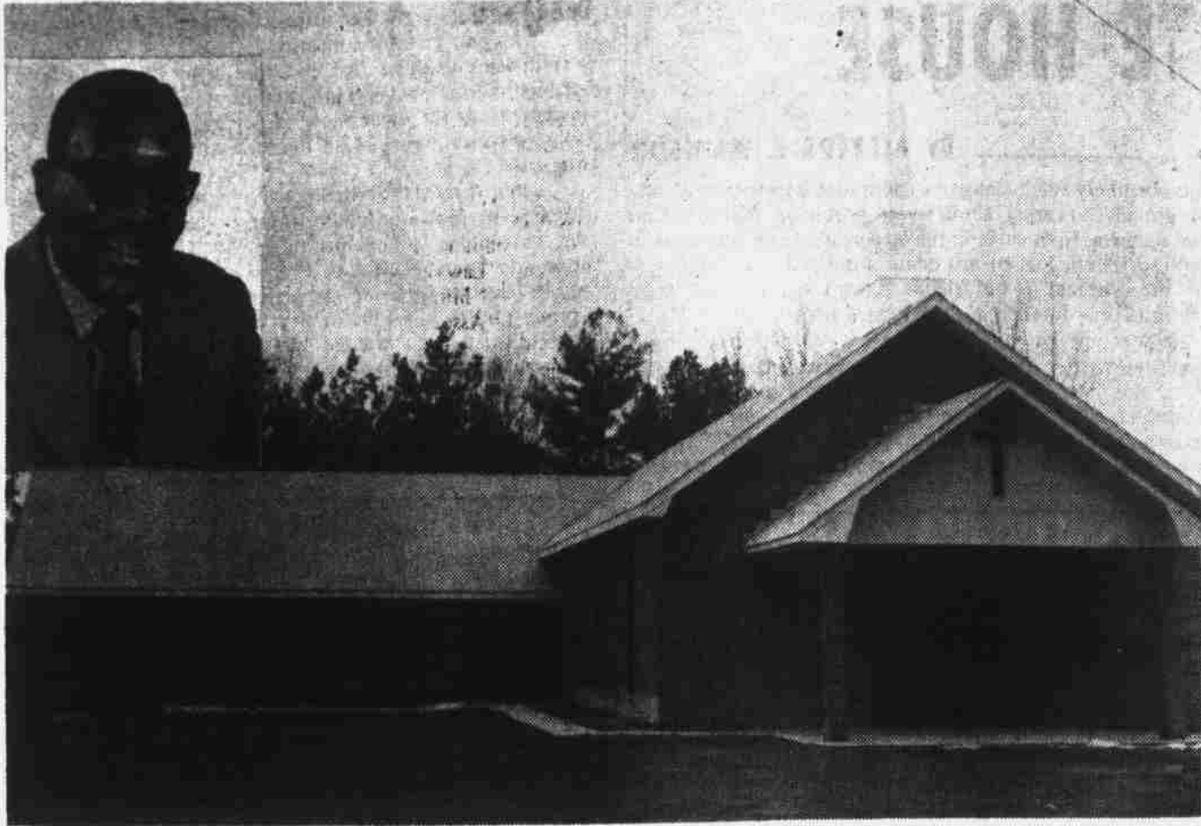
DEDICATION OF FIRST LEDGE ROCK IS PLANNED

A week of Dedicatory Services will be observed at First Ledge Rock Baptist Church on Redwood Road April 9-13. Local and area ministers, choirs and congregation will be responsible for nightly services beginning at 7 p.m.