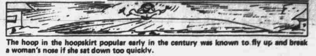
The hoop in the hoopskirt popular early in the century was known to fly up and break a woman's nose if she sat down too quickly.

3621 Durham-Chapel Hill Blvd. 929-0480 or 493-4411