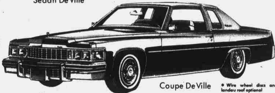
Coupe DeVille * Wire wheel discs and landau roof optional

These cars are equipped with power seats and windows, tilt & telescopic steering wheel, cruise control and other luxurious features that make Cadillac the standard of the world.