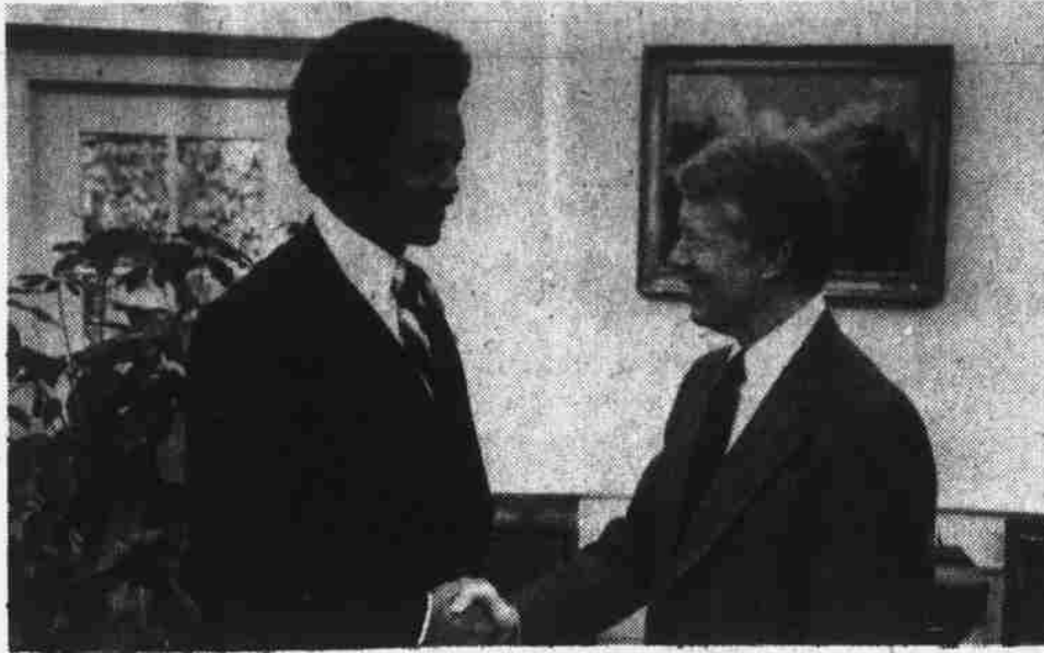
President Jimmy Carter greets the Rev. Jesse Jackson during a visit by the noted civil rights leader to the White House. The head of Operation PUSH in Chicago and former aide to the late Dr. Martin Luther King was in to see the President on matters of concern to the black community. Jackson's visit was also on the day of the 11th anniversary of King's death.