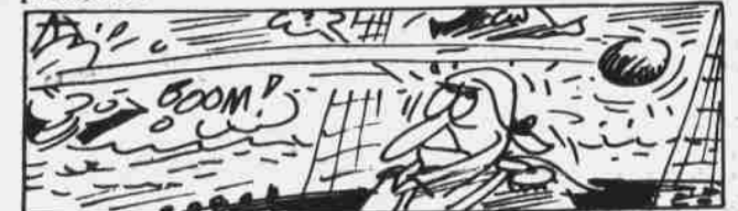
The origin of the word "salute" was the greeting of one friendly ship to another during the early days of fleet warfare when one ship would discharge all its guns to indicate it was disarmed—at least temporarily.

News items of community interest are greatly appreciated.