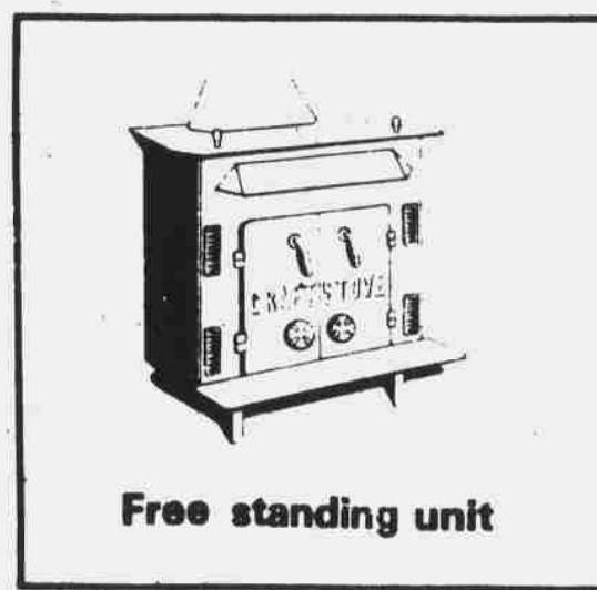
Free standing unit

TREMENDOUS SAVINGS ON THE AMAZING STOVE THAT CAN REDUCE YOUR HEATING BILL BY UP TO 80% SALE ENDS APRIL 30th