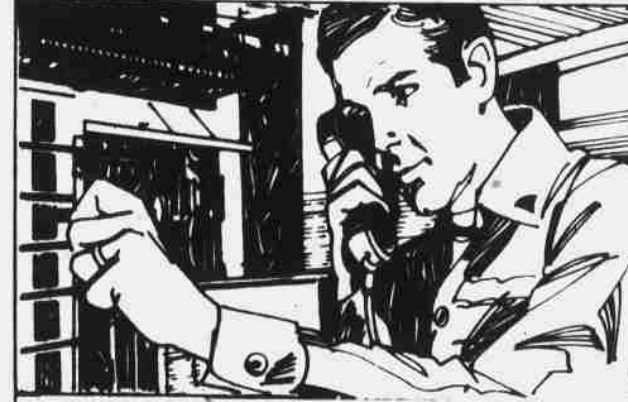
MEET TODAY'S ARMY RESERVE.

The Army Reserve has hundreds of part-time openings available in fields like Communications, Medical Technology, Auto Mechanics, just to name a few. And every one comes with a skill you can use full-time to help you build a rewarding civilian career. For more details, call your local Army Reserve Recruiter, listed in the white pages under "U.S. Government."