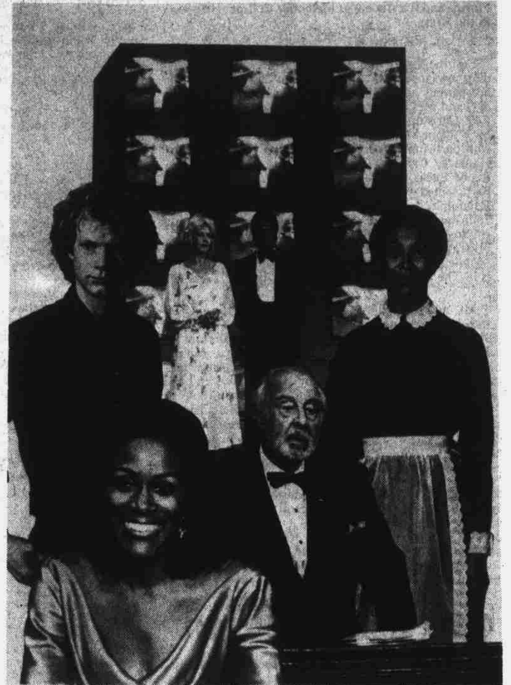
Television's finest dramatic hours of the past season on all the networks will be recalled when the ABC Television Network presents "The Television Annual 1978/79" at a gala party on Monday, May 14 (9:00-11:00 p.m., EDT), on WRAL-TV Channel 5.