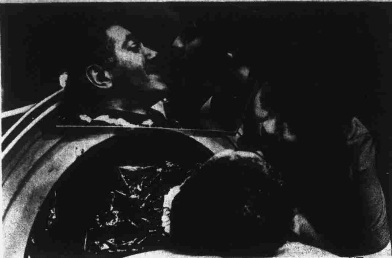
New Family Play

Representing these many moving hours are (center background) Michael Learned (left — "The Waltons") and Georg Stanford Brown ("Roots") representing American Heritage; James Stephens (left) and John Houseman (center), both of "The Paper Chase;" Olivia Cole (r) of "Backstairs at the White House" representing "professions," and Cicely Tyson (left foreground) to speak of women's roles in drama.