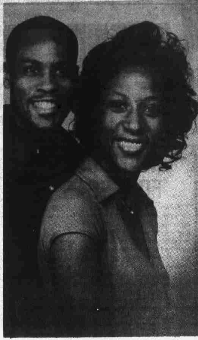
Carrington Engagement Announced