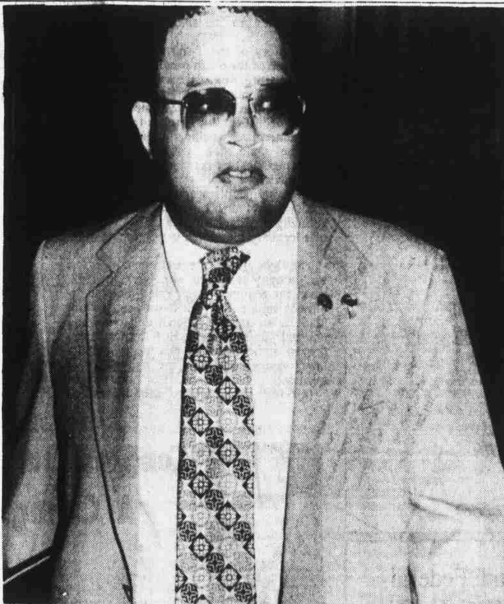
Rep. Diggs Leaves House

WASHINGTON - Rep. Charles Diggs, D-Mich., leaves the House floor after the House voted overwhelmingly in favor of a resolution of censure for padding his payroll and taking kickbacks from his staff in the mid-1970s. The vote was 414-0 with four members voting "present".