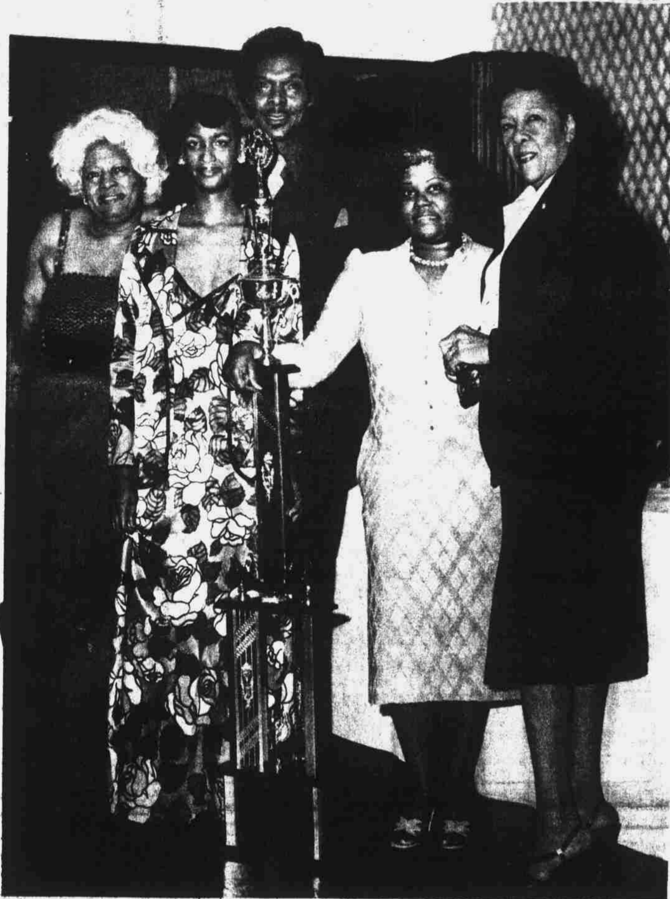
Master Trophy Winner

In 1893 wine was so plentiful and water so scarce that coachmen were seen washing down carriages with still champagne.