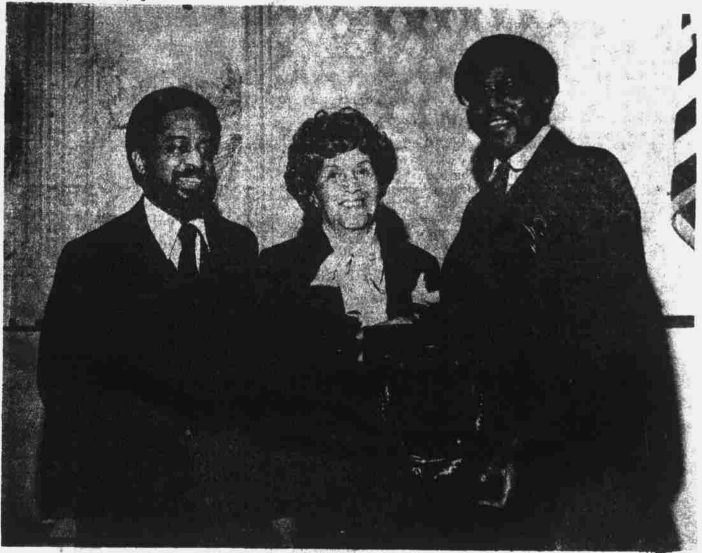
Community Service Awardees