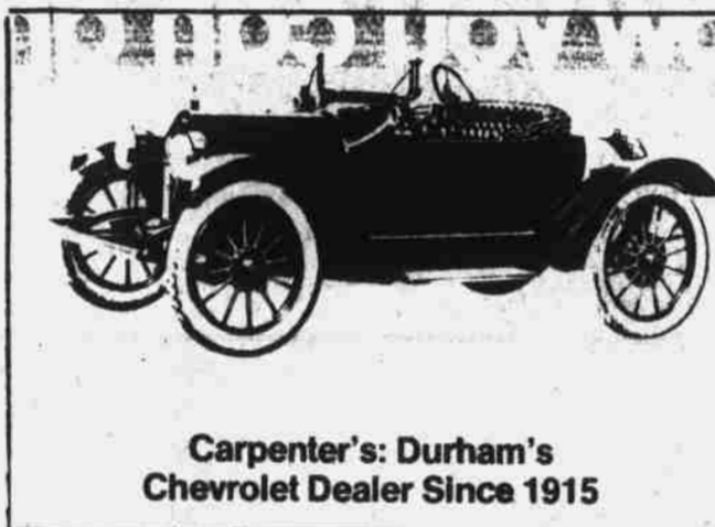
Carpenter's: Durham's Chevrolet Dealer Since 1915