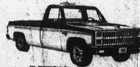
FLEETSIDE PICK UP

FOR "TODAY'S" SALES & SERVICE — 5 ACRES OF MODERN FACILITIES