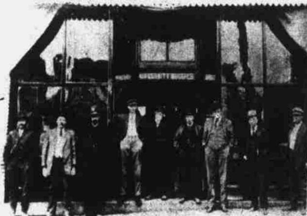
Carpenter's: Dealer for Corbitt Buggies and Studebaker Wagons — 1893