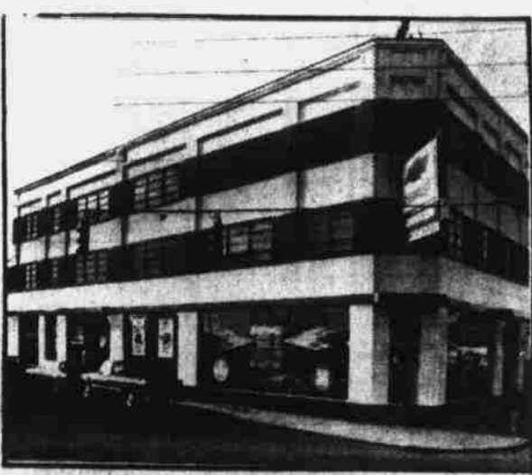
Present "CHEVROLET" Sales Area

ALL DEALERS ARE SELLING AT COST; BUT AFTER 88 Years ...CARPENTER'S CHEVROLET IS SELLING FOR LESS BECAUSE OF "MUCH LOWER" OVERHEAD (Our Facilities Are Paid For!)