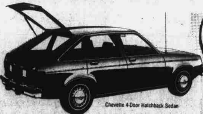
Chevette 4-Door Hatchback Sedan