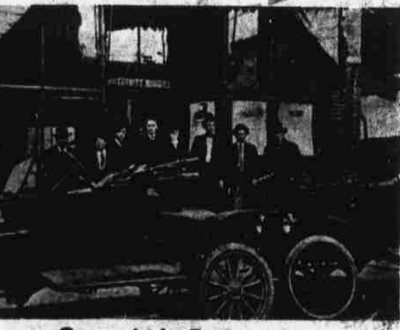
Carpenter's: Durham's "First" Ford Dealer — 1912