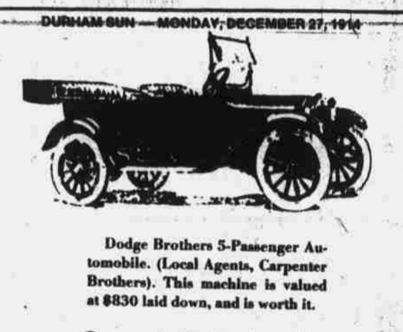
Carpenter's: Durham's "First" Dodge Dealer — 1914