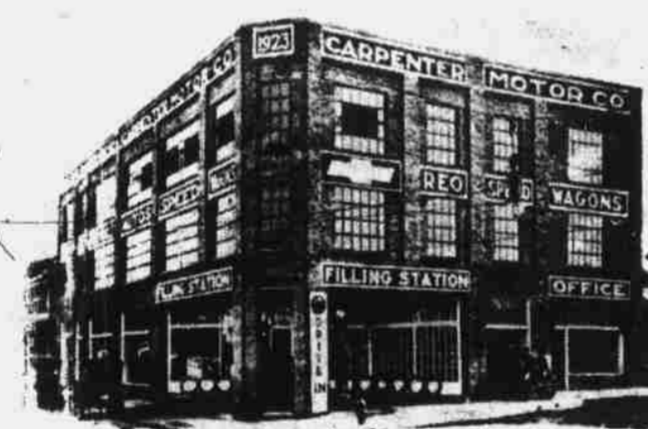
Carpenter's handled half the state on Reo Cars, Reo Speed Wagons, and Oakland Cars