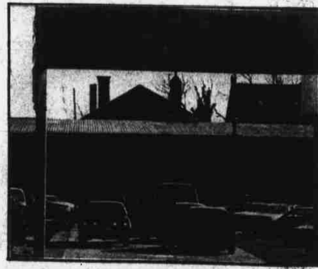
Present SERVICE Area

CARPENTER'S: Financing with General Motors Acceptance Corp. Since 1920