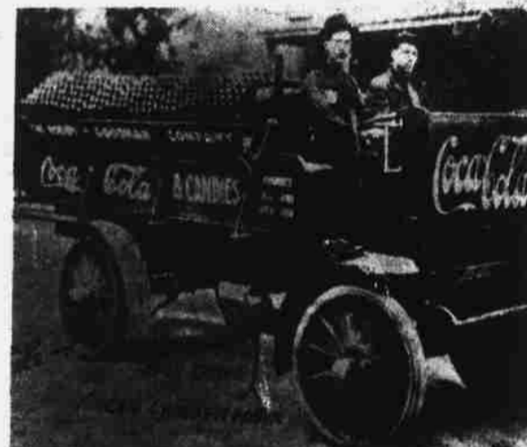
Carpenter's: Dealer for Metz Cars and Kola Trucks — 1910