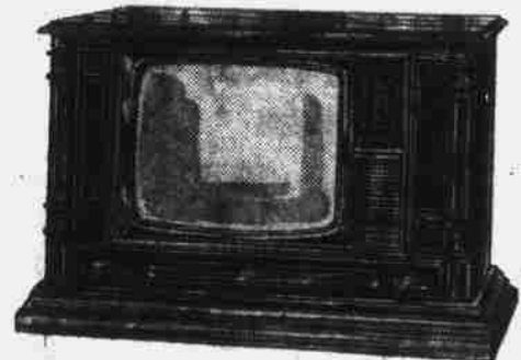
Rental Model—Not For Sale