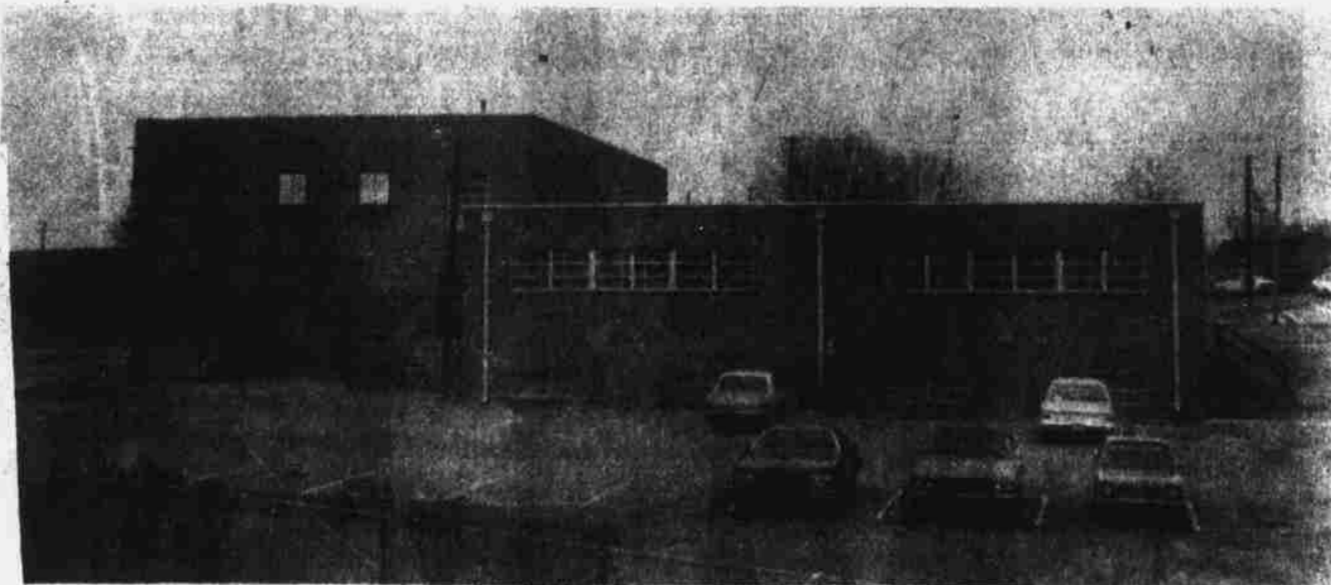
THE PRESENT SITE