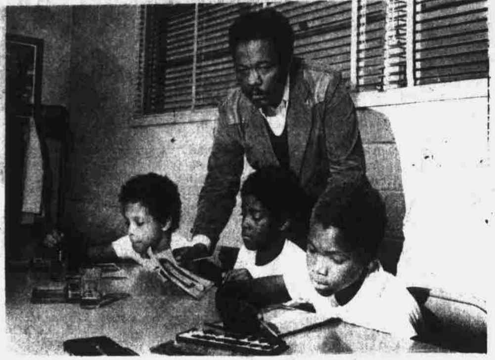
DEVELOPING ARTISTIC TALENTS