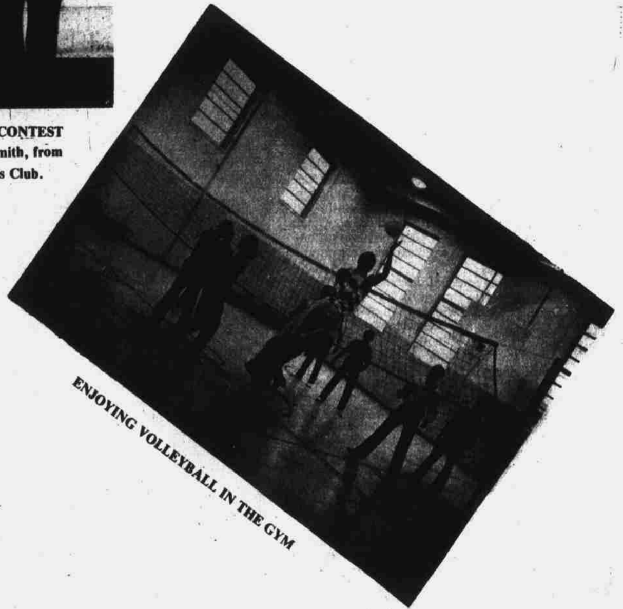
ENJOYING VOLLEYBALL IN THE GYM