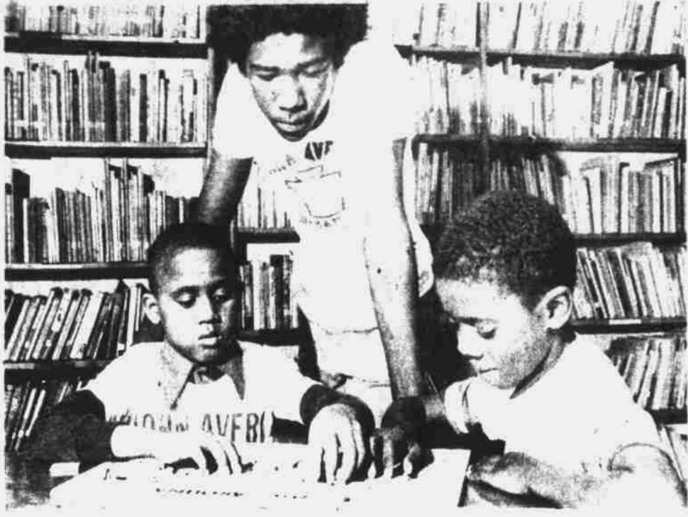
LEARNING SERIOUS THINGS IN THE LIBRARY