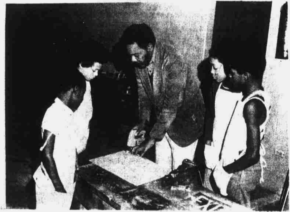
LEARNING FROM THE CRAFTSMAN