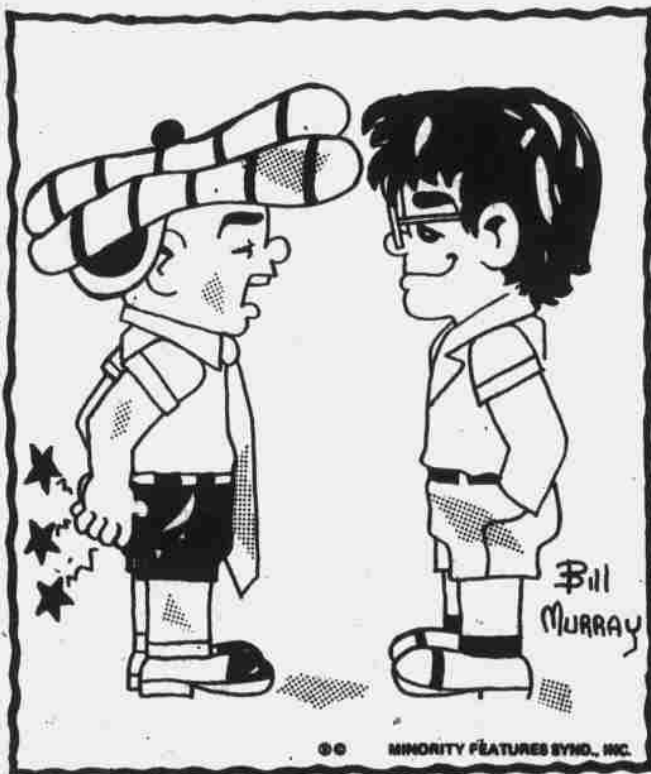
"All I did was LICK a book of dad's stamps so they'd be ready when he needs them!"