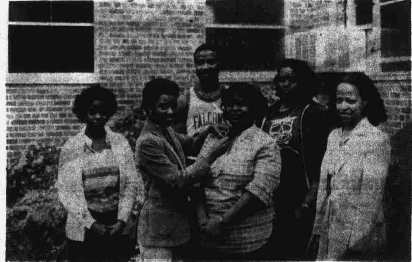
The Organization of Students Interested in Minority Affairs (OSIMA) at Jordan High School declared April 9 a memorial day for the 25 missing or murdered children of Atlanta. The student body participated by wearing green ribbons and bows. Members of OSIMA and the faculty advisor will con-