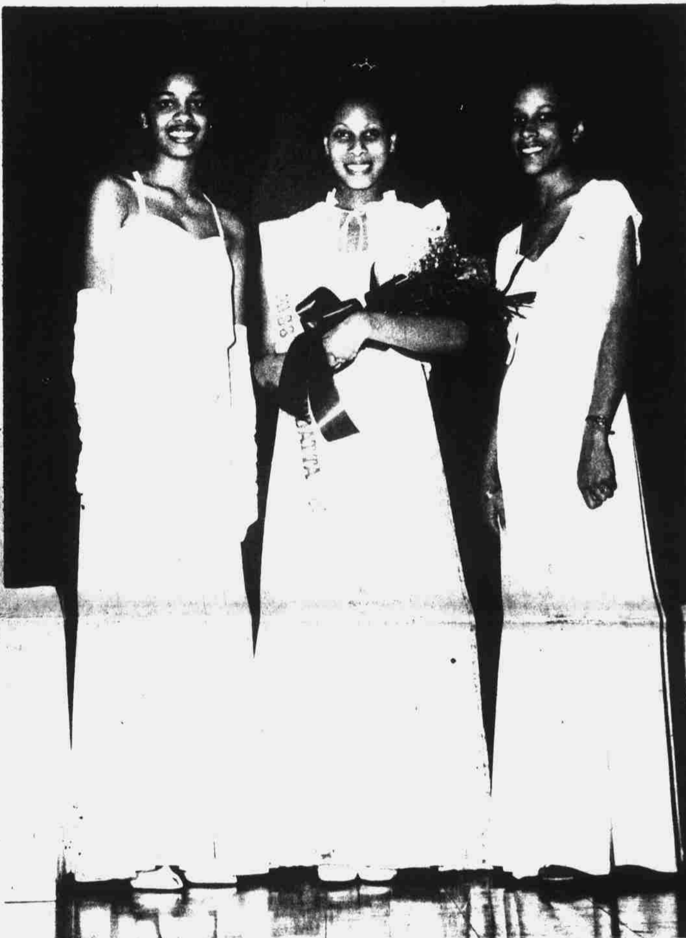
Miss Taugadetta and Runners-Up