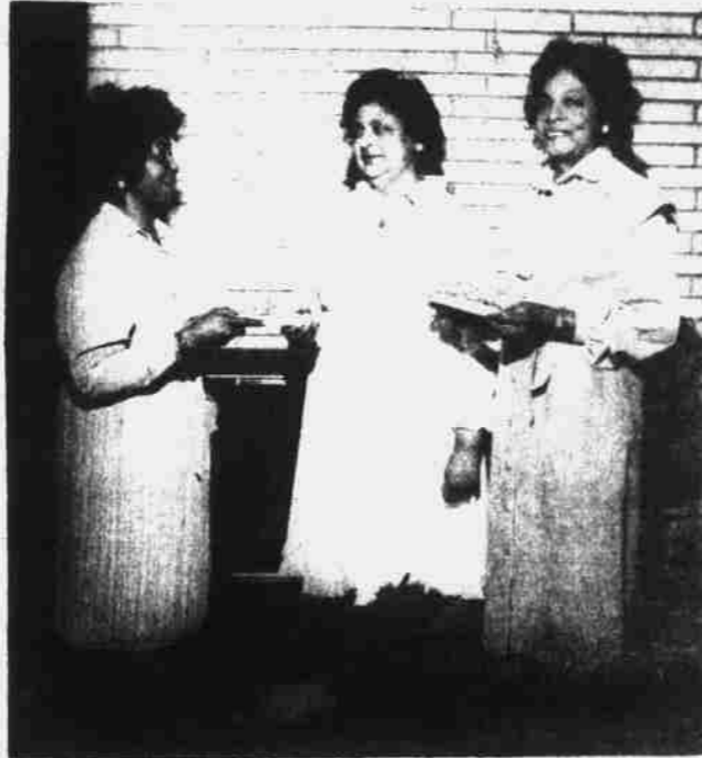
Honorees Receive Charm Bracelets