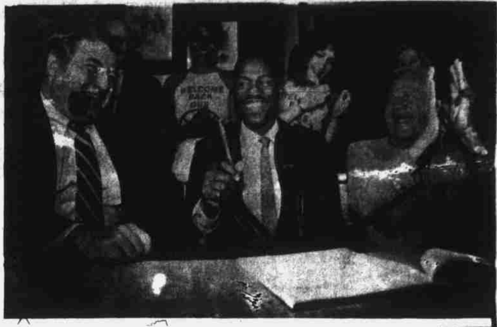
Signing Of 5-Year Contract Applauded

If past All-Star games are any indication, there should be plenty of fireworks.