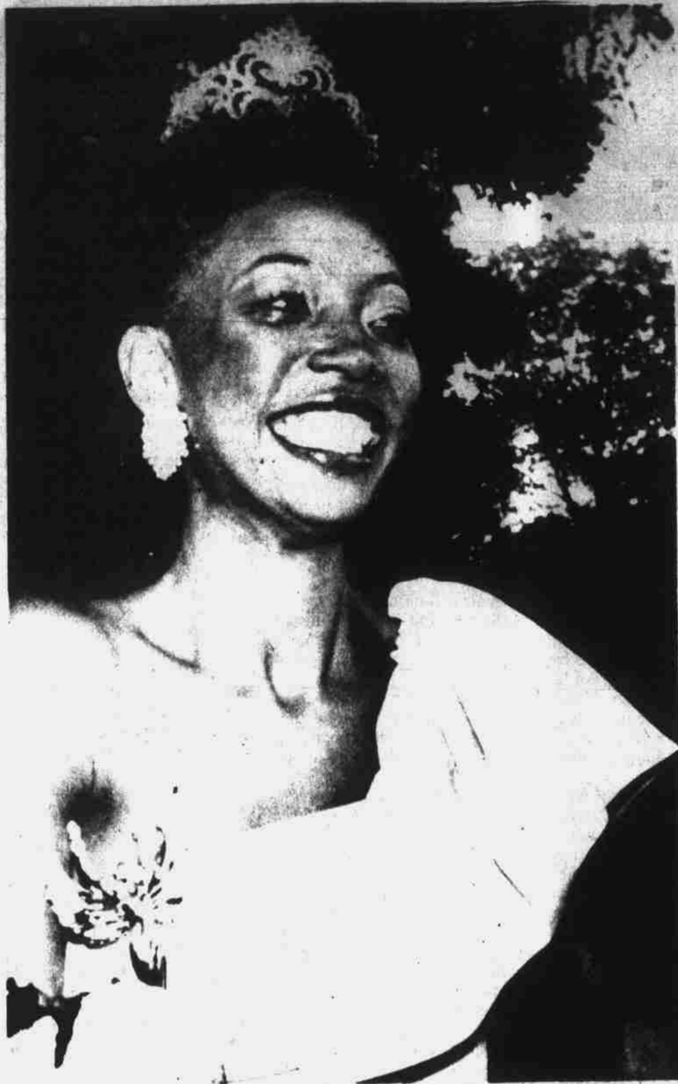
Miss Black America Crowned

Employee to perform skilled work in the operation of equipment and machinery used in water and sewer construction and maintenance. High school graduate with 4 years experience in water/sewer utility system maintenance. Some ability to interpret engineering plans and drawings desirable. Supervisory experience helpful. $11,803 - $15,818. Apply Orange Water and Sewer Authority, 406 Jones Ferry Road, Carrboro, NC 27510. Applications accepted until 5 p.m., July 21, 1981. E.O.E.