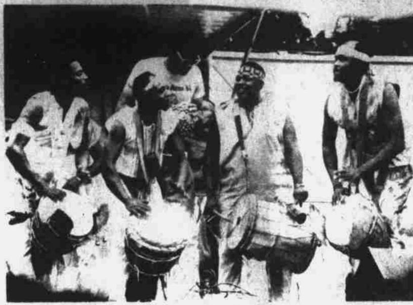
The Chuck Davis Dance Company entertained a very large audience in the evening.