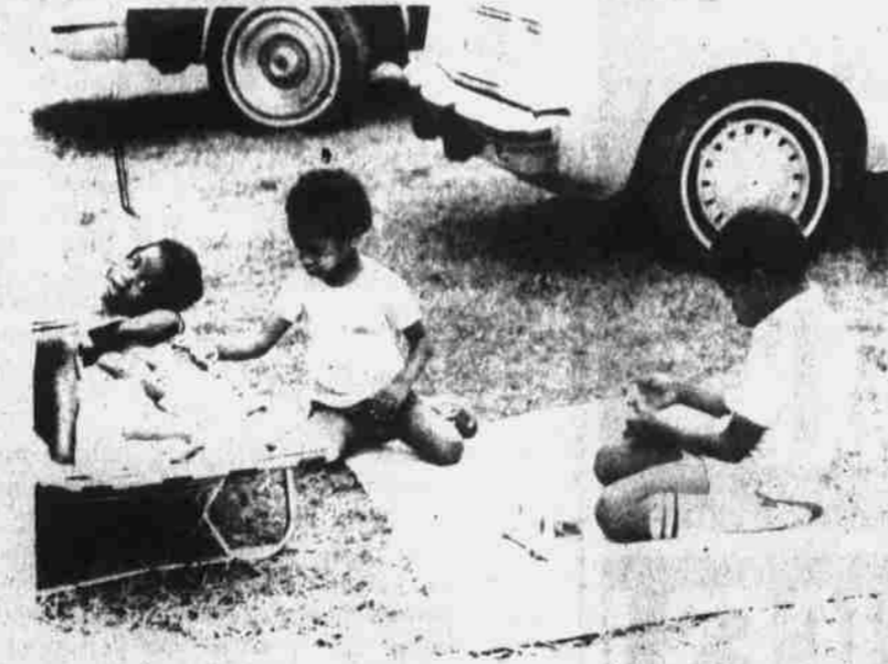
Children enjoying the company of each other.