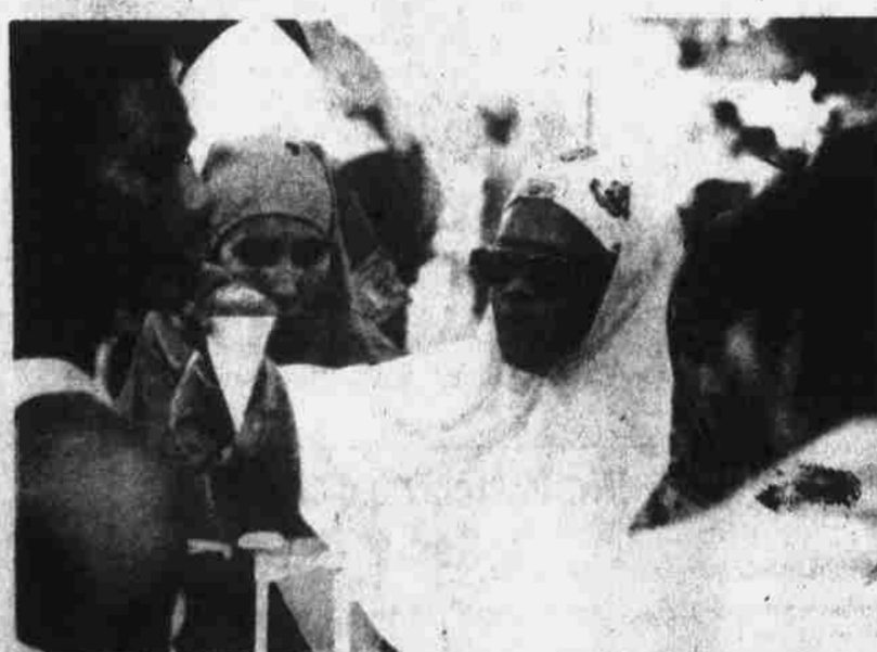
Those who braved the heat had an opportunity to cool off with snow cones served by Muslim women.