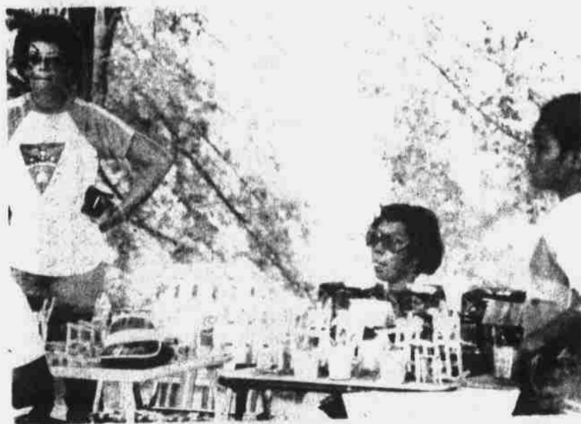
Another feature of the festival was a variety of crafts. In this case various objects made from ordinary clothes pins.