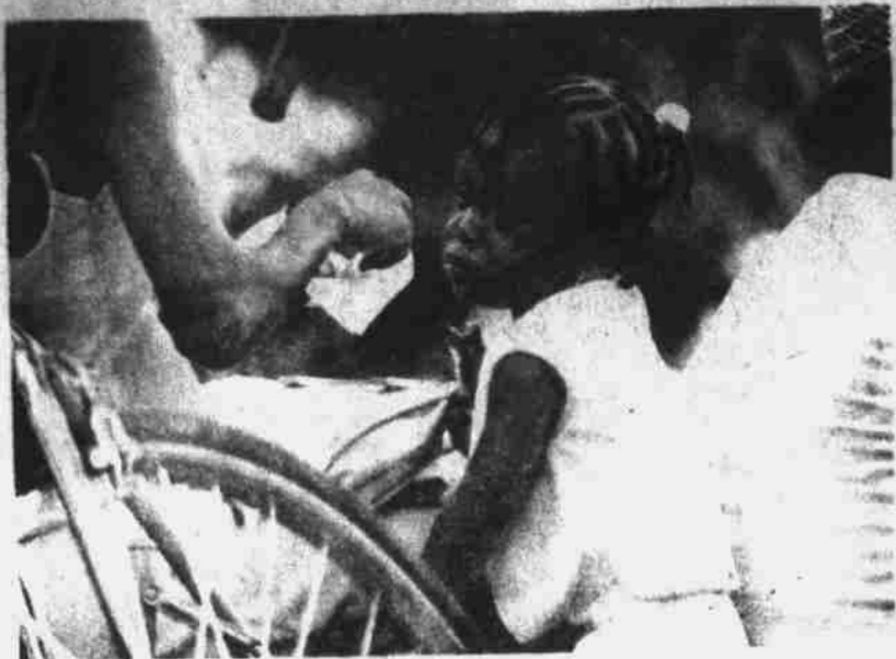
A little girl seems a bit worn by the day's activities but continued to munch on her late afternoon snack.

This year's Bimbe Festival appeared to attract the largest crowd ever. Thousands of people from throughout the area enjoyed the day's activities.