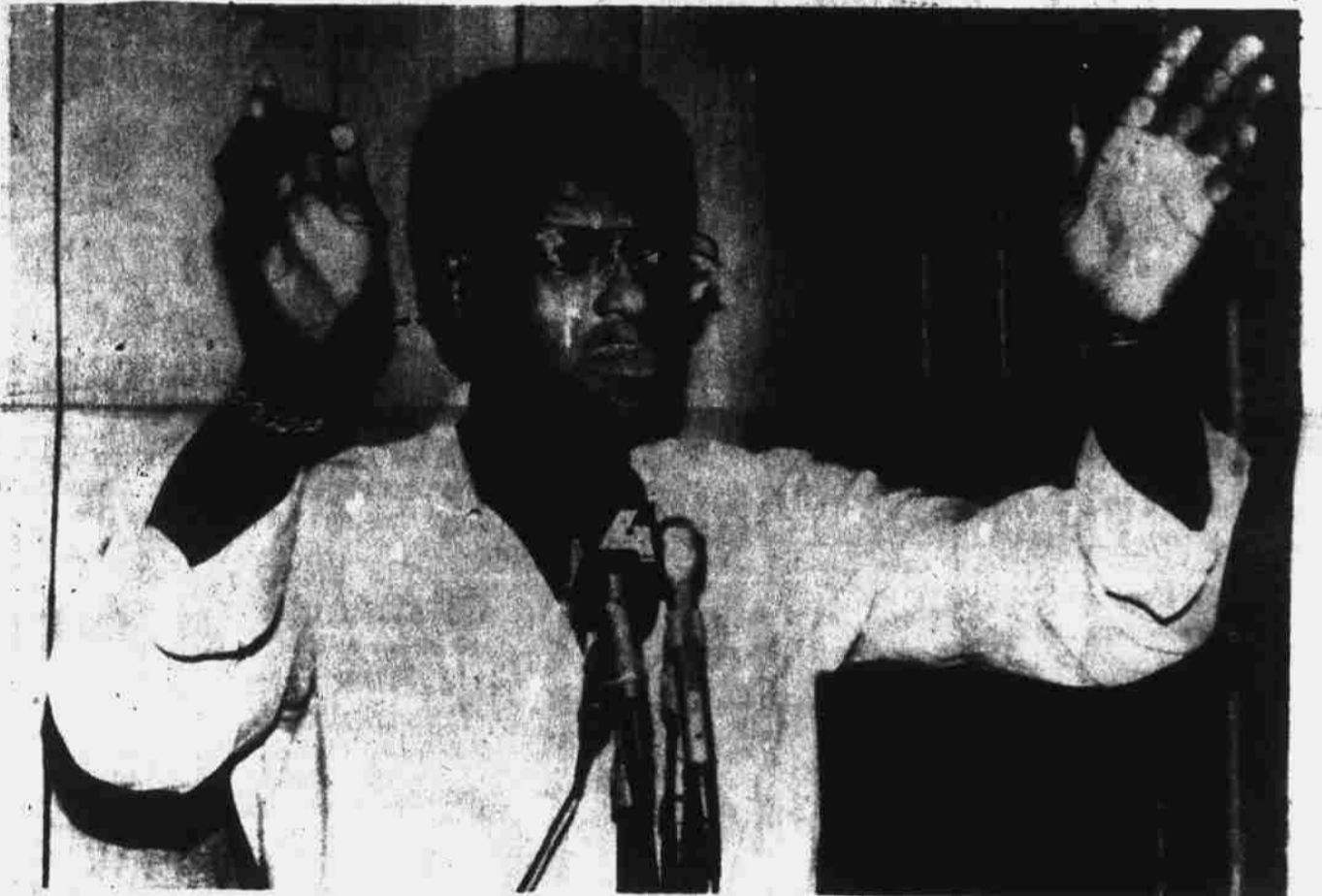
NEW YORK — Holding court at Shea Stadium, Hall of Famer Bob Gibson, now a New York Mets coach, talks of better times in baseball. Asked if he ever cheated (threw a spitball) the fireballer replied, "Once." Asked how he did it, Gibson said he spit on his fingers while everybody's attention was on a foul ball. Gibson was recently inducted into the Hall of Fame.

Homecoming is November 7 with D.C. College and FSU closes with J.C. Smith away.