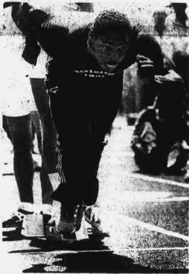
NAT. SPORTS FEST.—Georgia star Herschel Walker breaks out of the blocks during a practice session. A great sprinter, Walker told reporters track and football have equal priority for him at this time. He recently ran the 100 meters in 10.19, one of the best times on record.