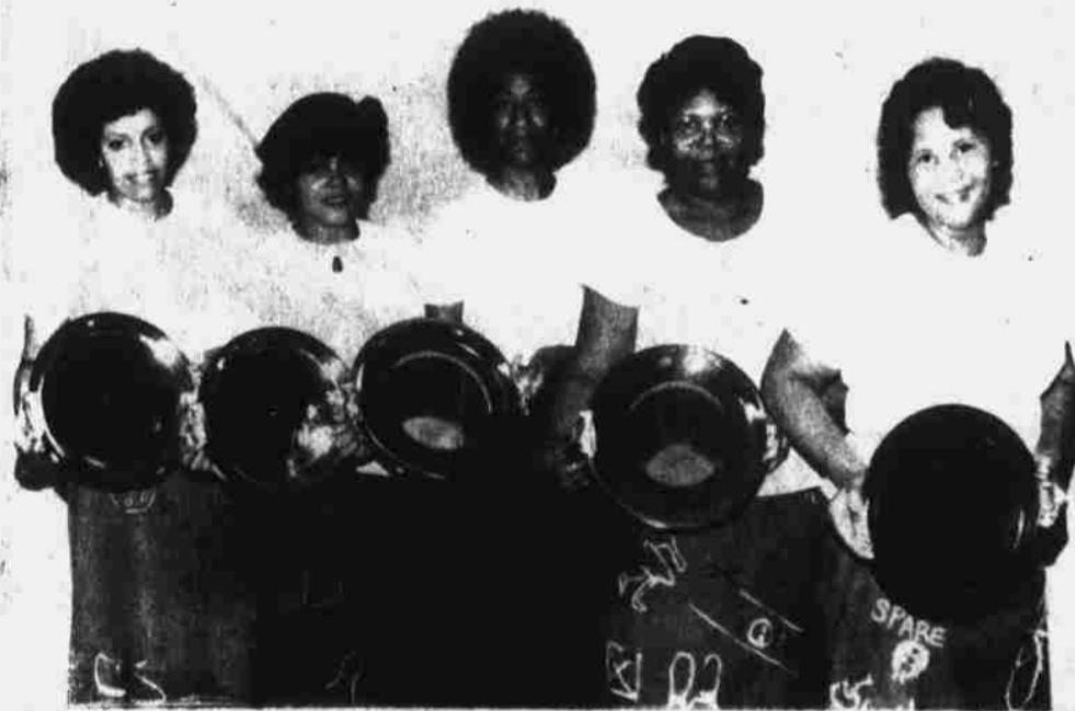
1981 Tourney Winners