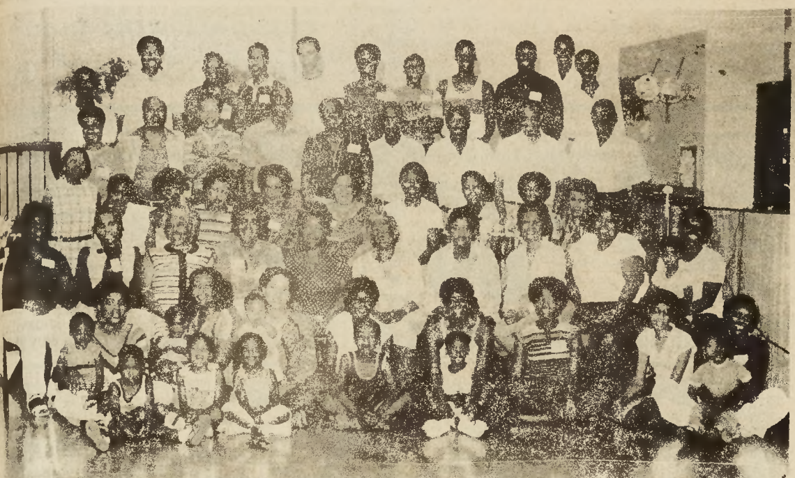
Dugger Family Reunion