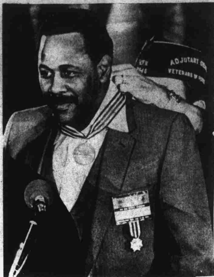
Stargell Gets VFW Award

To the Bulls players, I say, keep your chin up! The sun will shine again. And, despite it all, you have given this city many sunshine days over the past two years. We'll see some of you next year. For those moving on, good luck!