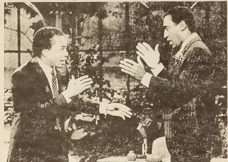
A Little Quick Hand Movement

most experienced city in the Carolinas. It's the only city other than Pasadena, California to ever stage a Rose Bowl game (1942) and more recently, the Black National Championship or Pelican Bowl in 1972. It should be pointed out that both bowls were transferred to Durham on short notice and they both were successful. Second, (again with no offense to Charlotte) Durham, which sits right in the heart of ACC country, is used to big time collegiate sporting events. With three of the ACC's glamour schools (Duke, UNC and State) all within twenty minutes of downtown Durham, the city is an old hand at putting on big football games. Third, Duke's Wallace Wade Stadium (capacity 56,550 which can be expanded to 65,000) is bigger than any football field that Charlotte can offer and the historic stadium has just been renovated. It now possesses what Duke proudly claims is the best media facility in America. I know you Charlotte people will point out that you're the only true "big city" in the Carolinas and with a population in